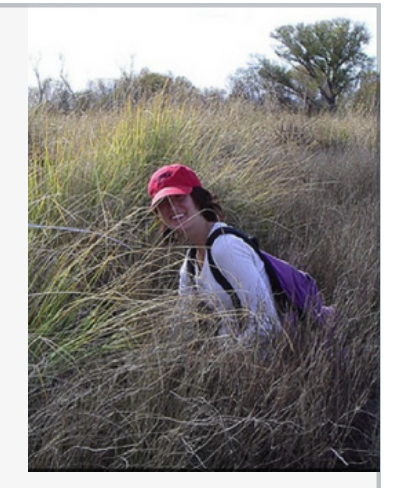
Students at Biosphere 2 REU Site Grant (Earth System's Research for Environmental Solutions) do both field research and lab work